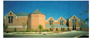
Hampton Public Library Victoria Blvd.