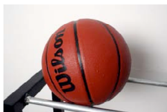
Ryan Gothrop Glasketball