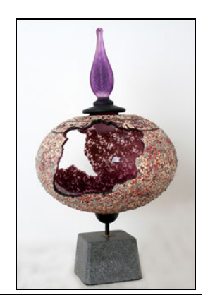
Best in Show 2009 Philip Nolley "Altar Vessel"