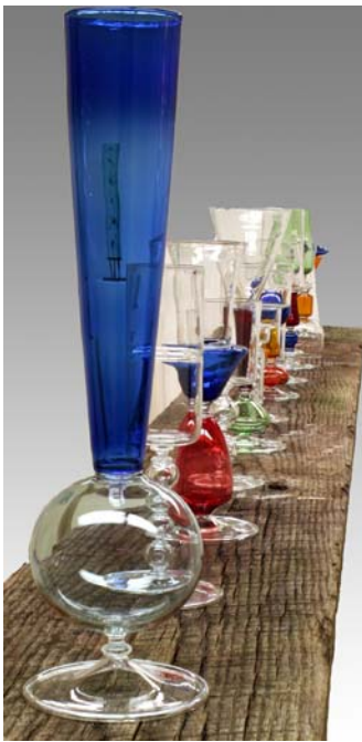
Series of Goblets Emilio Santini